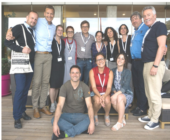
EFRJ team — Tirana, 15 June 2018