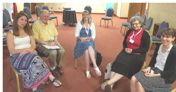
EFRJ editorial committee meeting — Tirana, 15 June 2018